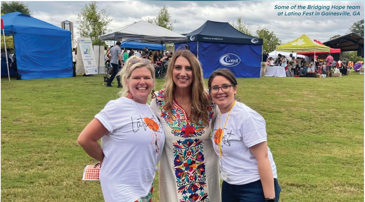
Some of the Bridging Hope team at Latino Fest in Gainesville, GA